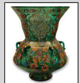
A French Enamelled "Persian-Style" Glass Mosque Lamp, circa 1890

Islamic art is essentially a contemplative art, which aims to express above all, an encounter with the Divine Presence. It receives its beauty not from any ethnic genius but from Islam itself and just as Islamic science has its roots in the Qur'an and Hadith, so the typical forms of Islamic