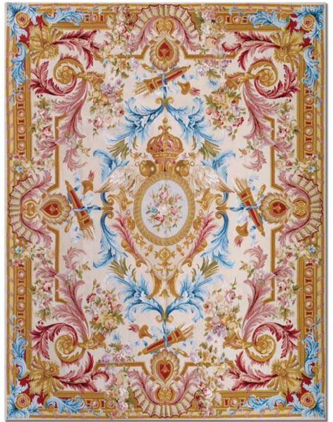
Louis XVI design Aubusson wool tapestry