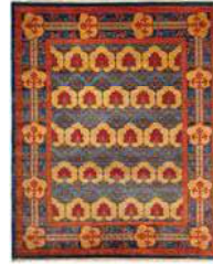
Inside Samovar page 5