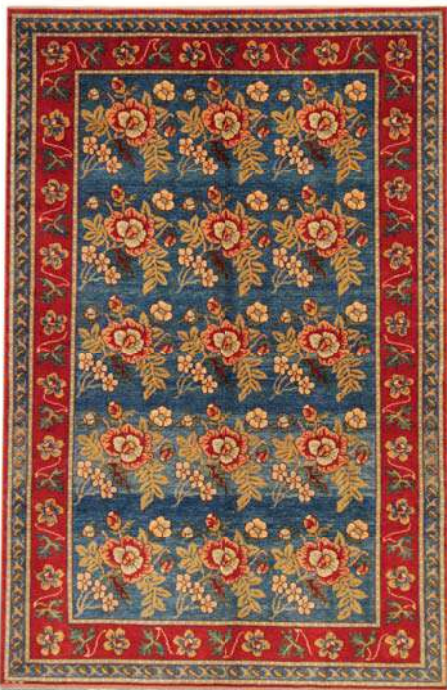
Karabagh design wool carpet by Has Hali