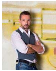
The Rug Addict page 6