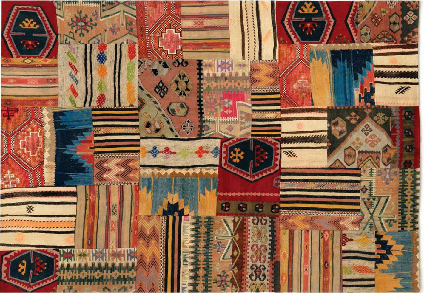
19th Century Vintage Uzbekistani Kilim patchwork