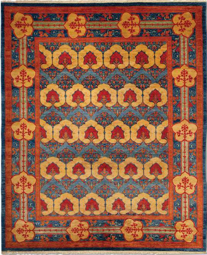
Agra wool carpet inspired by the Arts & Crafts movement