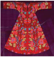
Kaftan Art page 3