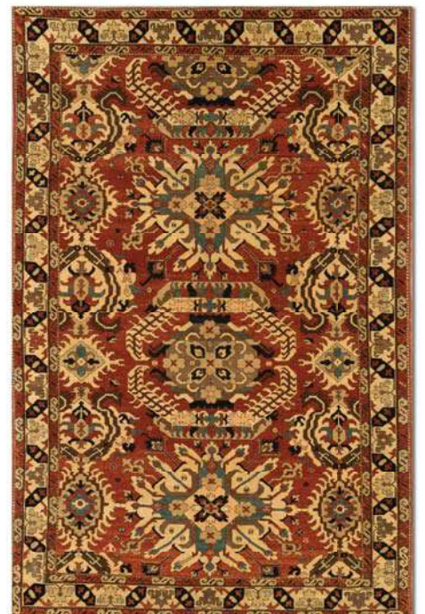
Kazak design wool carpet by Woven Legends