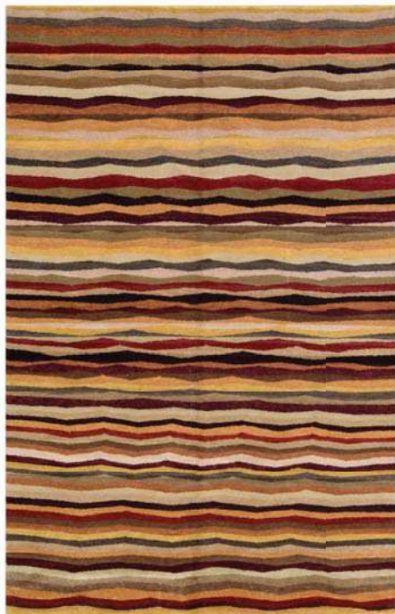
Multicolor Modcar wool carpet